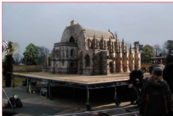
Miniature Roselyn Chapel from the DaVinci Code.

It seems barely a day goes by without breaking news of some new development in HD acquisition or storage. HD televisions and channels, varying formats of HD DVD, and new methods of digital projection are all falling into line behind the movement to facilitate distribution. But as the shift to HD gains ever increasing momentum in both film and television, what effect is this having on the way companies and studio departments function? Already, courses are being set up to retrain make-up artists to cope with HD's sharper, more detailed image; after all, we wouldn't want to see the reality of spots, blemishes and moles on our stars of the silver screen – would we? And what about set design? Has the level of detail needed to be increased? Has this translated into increased work-hours? Does filming an HD feature mean a more expensive budget for sets? Could the world of shooting miniatures, where fine detail is an essential for realism, become too costly just when this more established form of visual effect is returning to popularity as an alternative to CG environments?